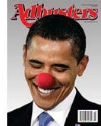
#89 MAY/JUNE 2010 The Ecopsychology Issue

Send a gift Change Address Contact Donate