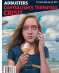
#93 Jan/Feb 2011 The Big Ideas of 2011