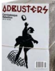
#92 Nov/Dec 2010 The Carnavalesque Rebellion Issue