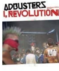
#91 SEPT/OCT 2010 The Revolution Issue