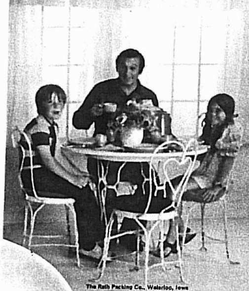
The Rath Packing Co., Waterloo, Iowa

So why should we mind if our bacon is the last to market—if it's the first bacon you'd bring home.