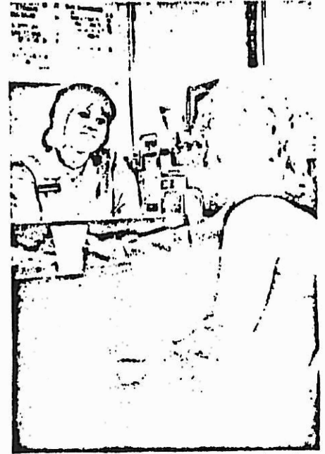
"Supergroup" therapy in patient-run coffee shop provides testing ground for new personalities.