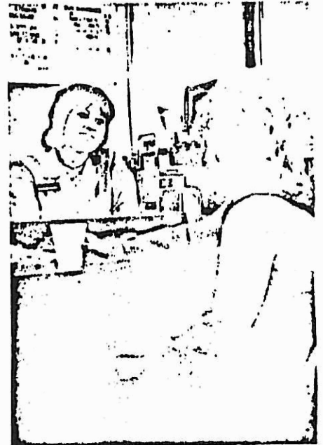
"Supergroup" therapy in patient-run coffee shop provides testing ground for new personalities.